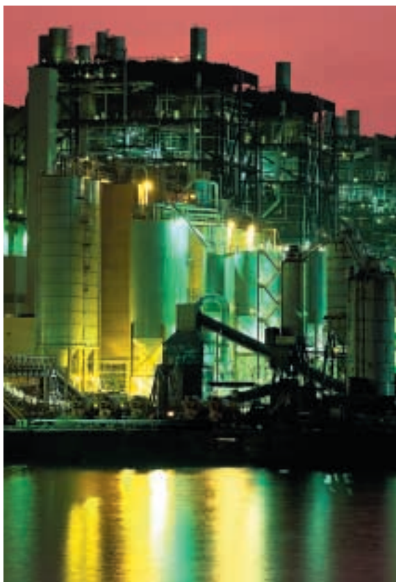
Lamma Power Station at night showing important environmental protection facilities: ash silos (foreground) and boilers fitted with low NOx burners (background).

During the year, Hongkong Electric has expanded into a new energy market – gas distribution in the United Kingdom – through the acquisition of a 19.9% stake in the North of England Gas Distribution Network. The transaction is due to be completed in mid-2005.